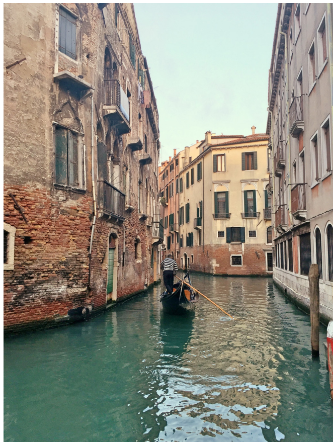
Figure 4 'I was drawn to this photo because of the contrast between the worn-out buildings on the left and the newer on the right...I wonder if I am drawn to this because his path is unclear—it looks like there may be two paths...Perhaps I feel trapped on a boat, on a path unknown, unable to just step off and take a breather. It certainly feels that since I headed to university to study medicine, there have been times when I have thought about what it would feel like to do something else or travel the world, but felt unable to diverge from the path I was on, or step off the boat.'

encountered on their journeys, how these difficulties originated and their strategies for tackling them (see figures 2 and 3 ). Pathways and roads were the most coded for visual elements in the photographs. There were frequently intersections, junctions and stops where the future path was obstructed or unclear. Along this symbolic way there was always the potential to stop, to contemplate their destinations, to reconsider and, where necessary, to adjust their routes. See, for example, figure 4 and the associated reflection.