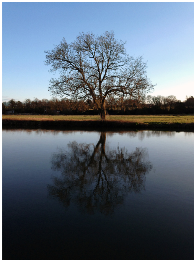
Figure 5 'The tree is looking at its own reflection as a form of introspection ... I think this represents that I value time to myself, on my own ... away from the crowd.'