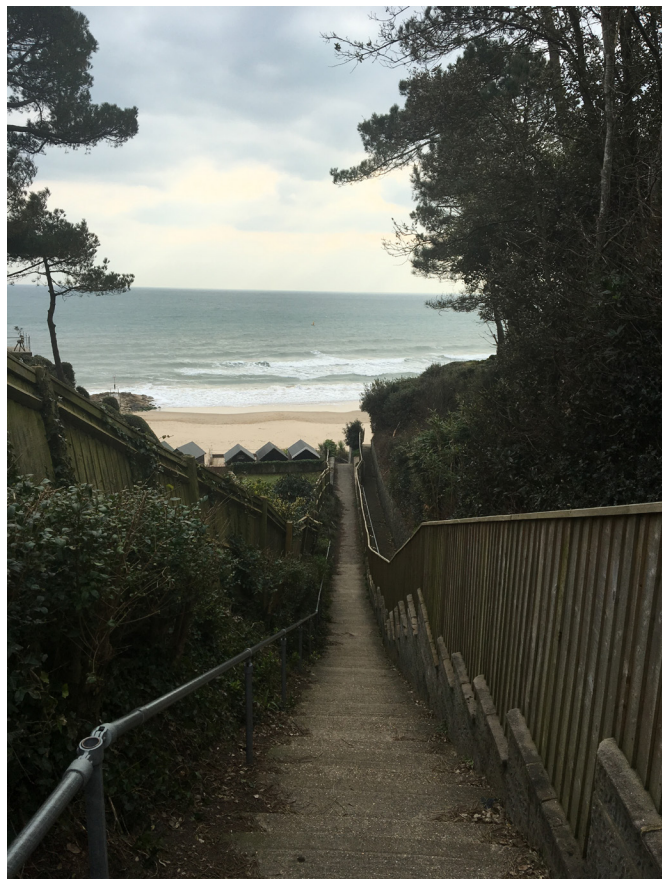
Figure 1 'The path is not a particularly pleasant place but it is worth the short journey as the photographer will end up somewhere lovely. I think the path represents the final part of my training and the beach is the final goal of being a GP.'

and/or associations experienced by another person (the photographer of each picture).