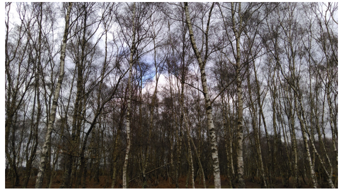
Figure 3 'There is an obstacle and no clear path to the 'other side'. They both show a 'here' and 'there'. The 'there' symbolises where I want to end up, where there is light and open space, which to me represent possibility, freedom and fulfilment. I think I create the obstacle from my own surroundings out of negative thoughts and self-doubt. But the majority of the frame is ordered and bright, making it feel hopeful. I think this is my subconscious suggesting that my doubts about my ability are groundless.'

This work started as an innovative pedagogical development in our GP training scheme and the power of photographs to develop reflective capacity became clear as the project unfolded. Consequently, on completion of the workshops, when